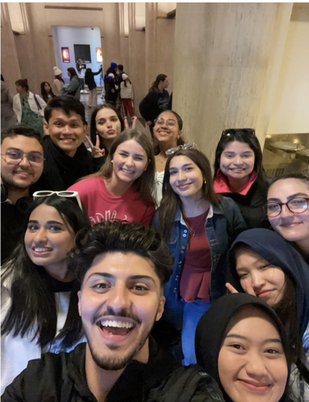
At Griffith Observatory with fellow UGRADS