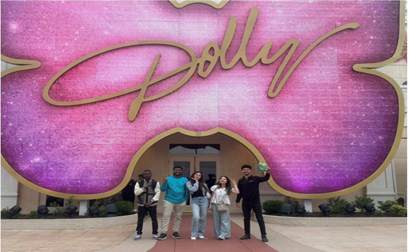
At Dollywood, near Pigeon Forge, Tennessee