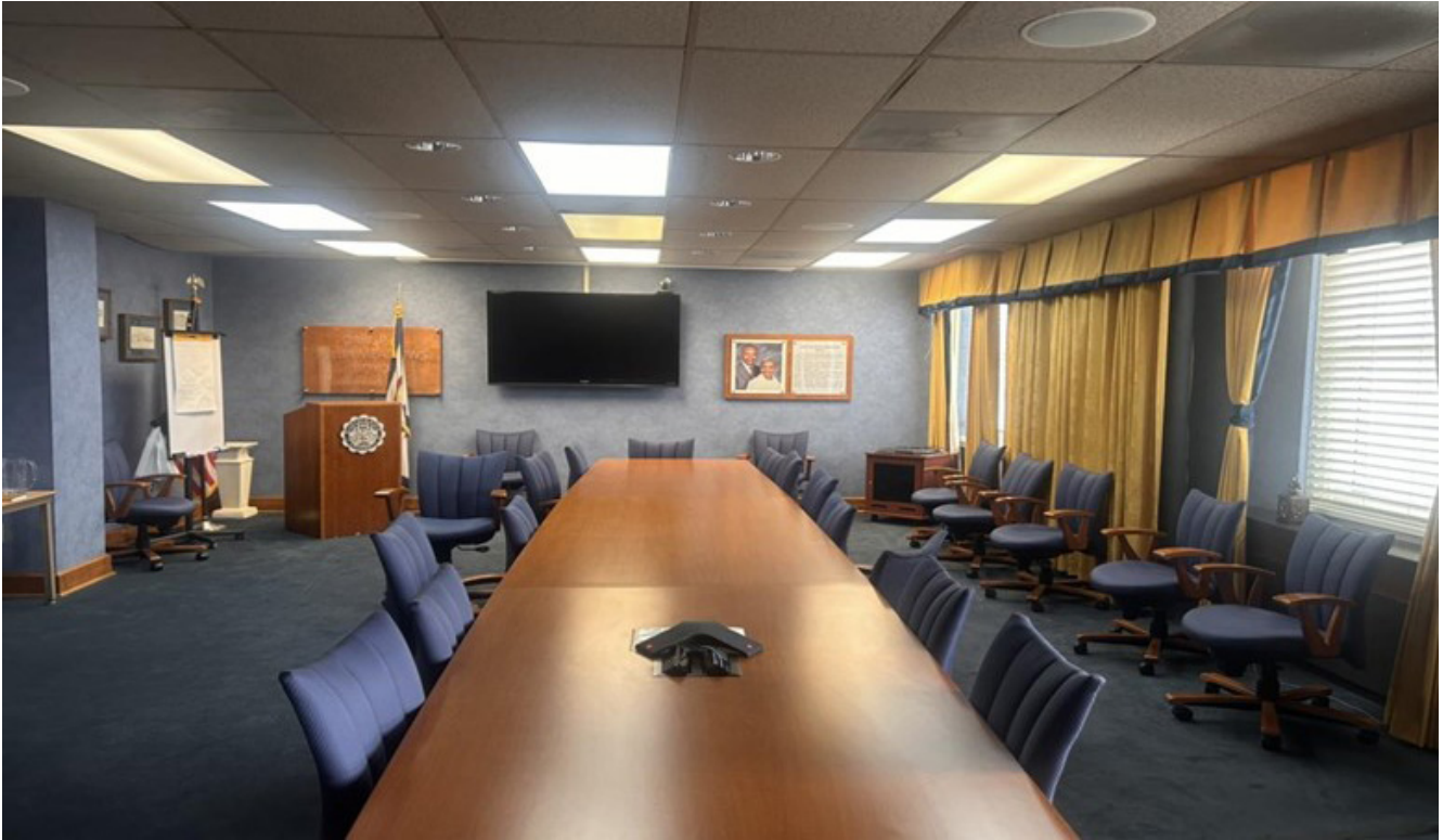
Boyd Conference Room in Conley Hall