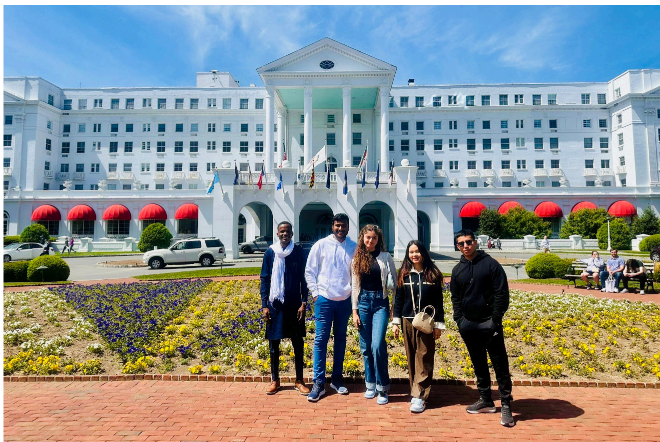
At the Greenbrier

These internships gave us meaningful insights into the structure of U.S. higher education, strengthened our communication and organizational skills, and allowed us to contribute to the university community in a real and impactful way.