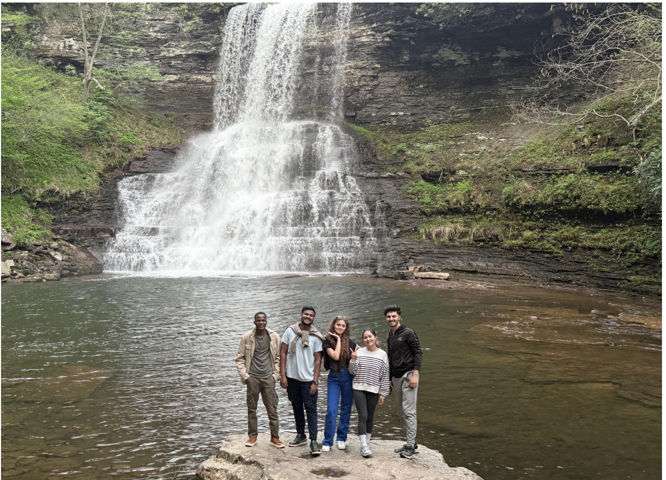
At the Cascades in Pembroke, Virginia