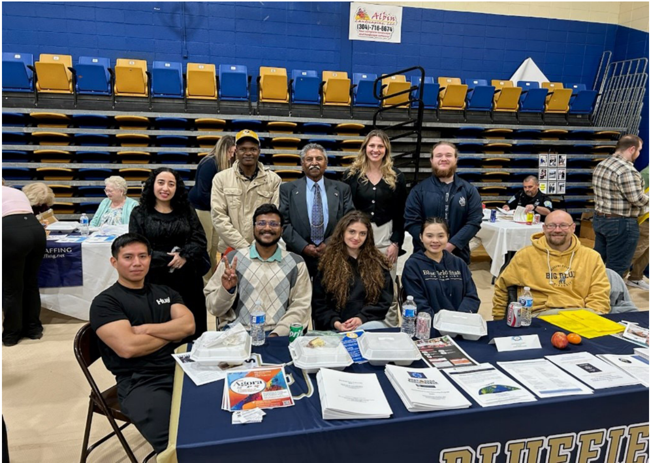
At the Career Fair, April 9, 2025