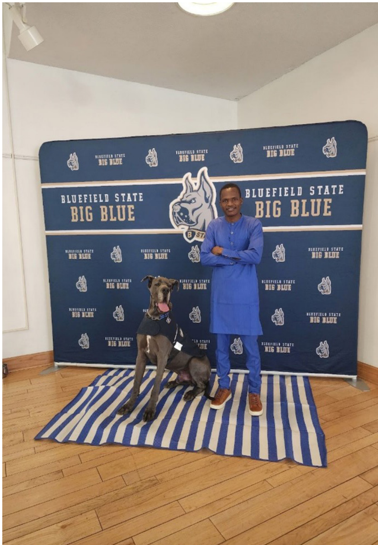
Radjickou Kane and Sir Blue