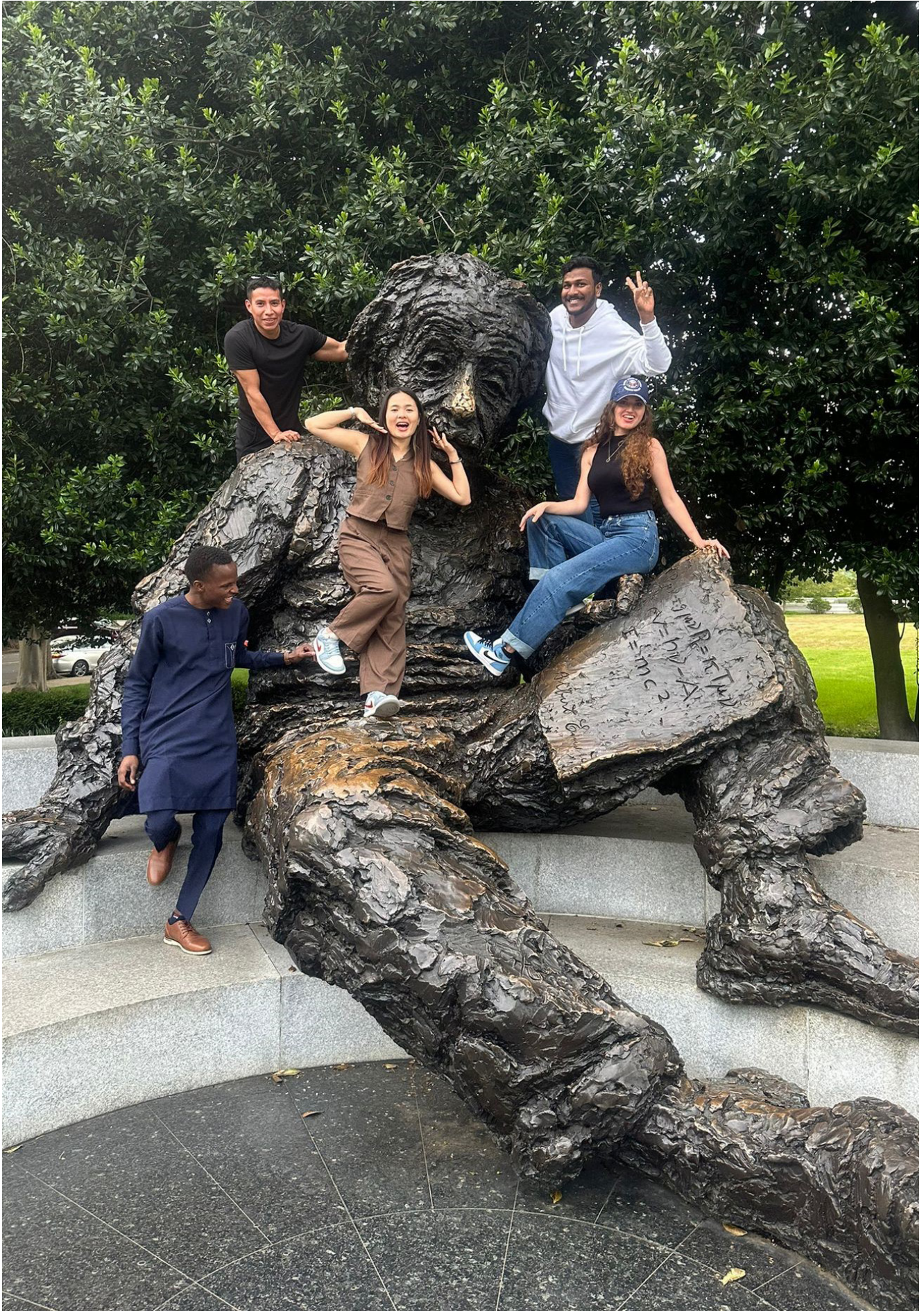
Atop the Albert Einstein statue in Washington, D.C.