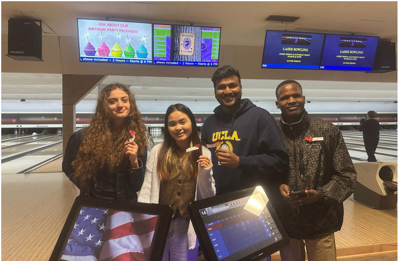
At Mountaineer Family Entertainment bowling lanes