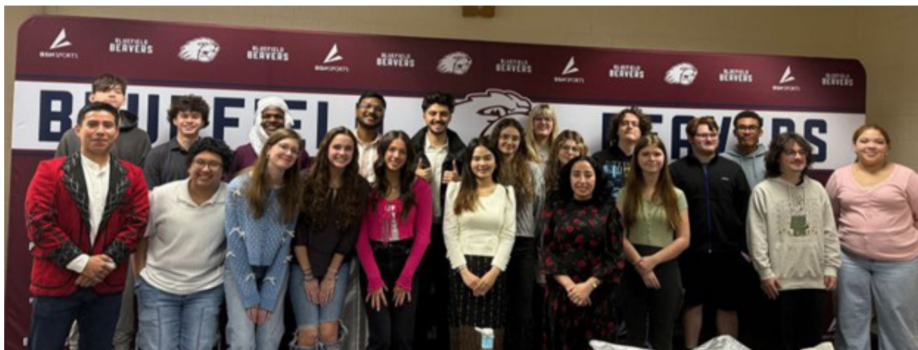
Bluefield High School students welcomed the Global UGRADS

states of Florida and California, gaining a deeper understanding of America's regional cultures, historical landmarks, and everyday life.