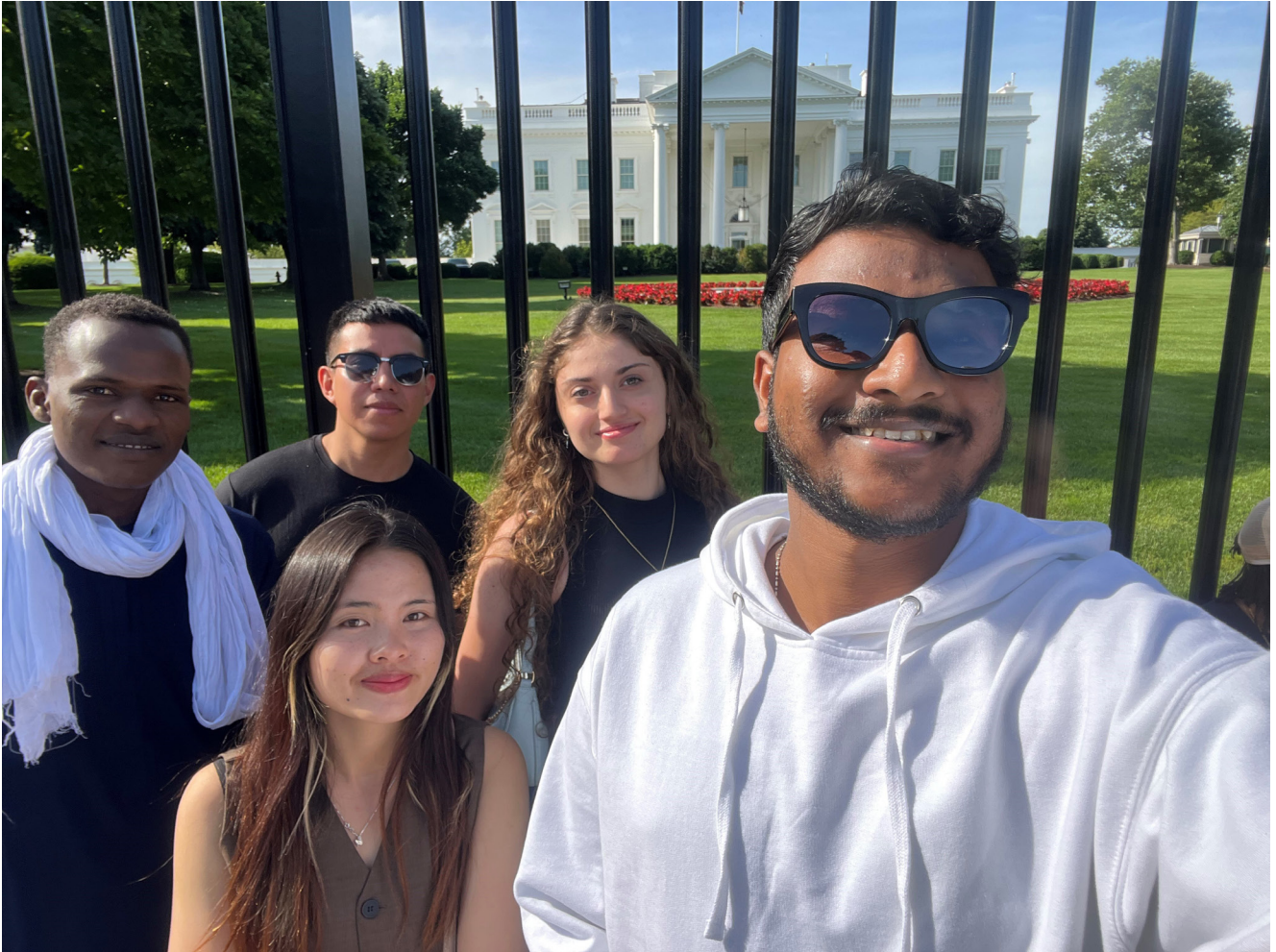
In front of the White House