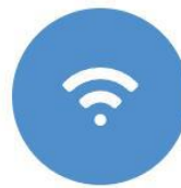
HIGH SPEED CONNECTION