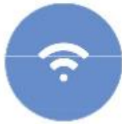
HIGH SPEED CONNECTION